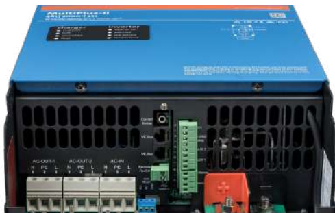
Connection Area MultiPlus-II 3k