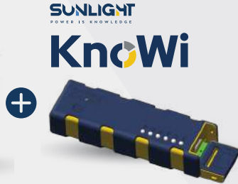
BMS data capture & upload in GLocal